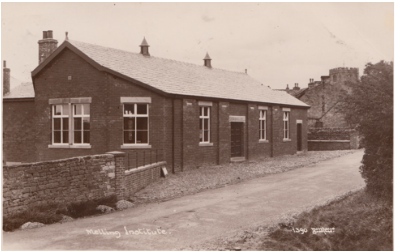
An old picture of Melling Institute dated 1925.